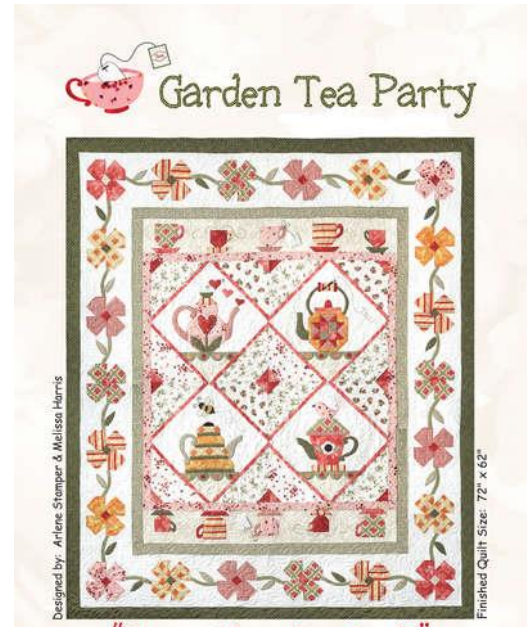
Garden Tea Party Six months