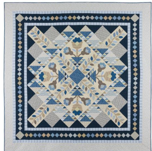
Country Crossroads Seven months

Regular Hours Mon.-Sat. 10 - 5 Sun. 12-4 Closed Easter