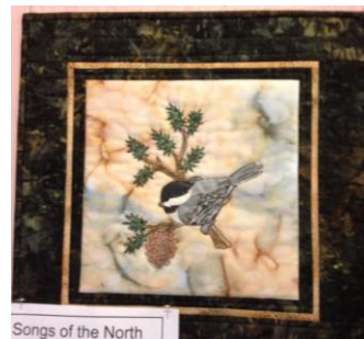
Songs of the North

Thursdays Feb. 5 and 12 from 10-2 $25 for one class or $40 for both