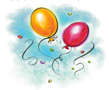
It's been 7 years!

Join us Dec. 3, 4 & 5 for our celebration. Christmas patterns, Christmas fabric on the bolt (1 yd min.), precut panels, and selected children's fabrics will be 25% off. We will also be demonstrating how to make pillowcases and Bouquet (or Christmas tree) napkins.