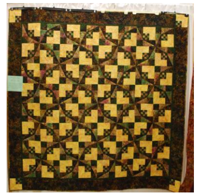
Pieced- Becky Kopicko for Birds & Whirligigs