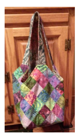
Mondo Bag...Kathy This bag holds everything you need or think you may need. It uses Quiltsmart panels so your seams match with no effort. Thursdays Nov, 6 & 13 from 10-2 $30 plus materials