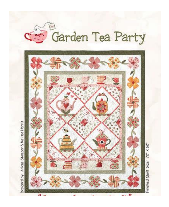
Garden Tea Party Six months