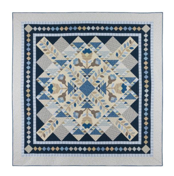
Country Crossroads Seven months